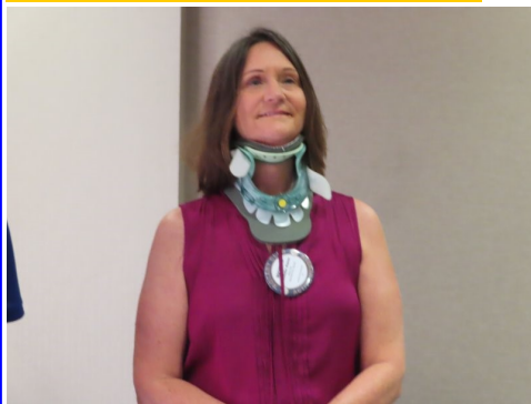
Only 3 more week of the brace!