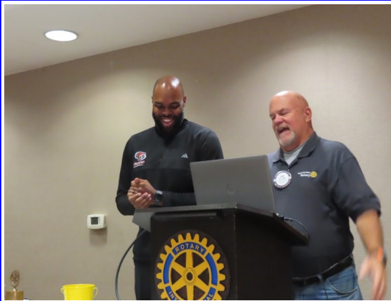
Whose your barber?